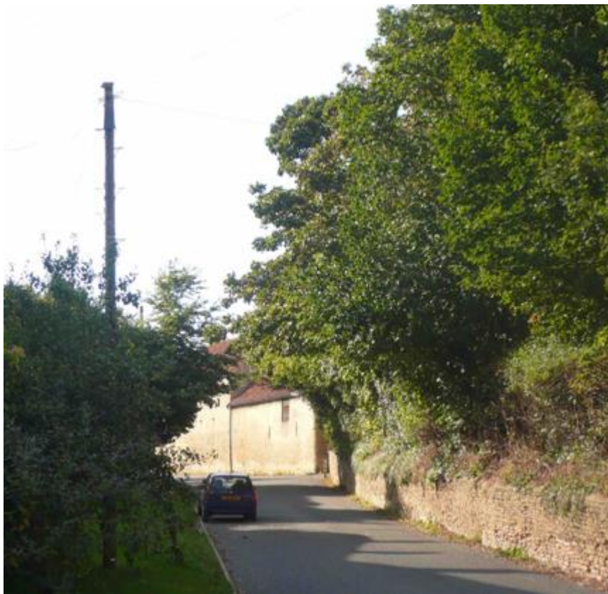
3. Enclosed views to the east and west along Colsterworth Rd.