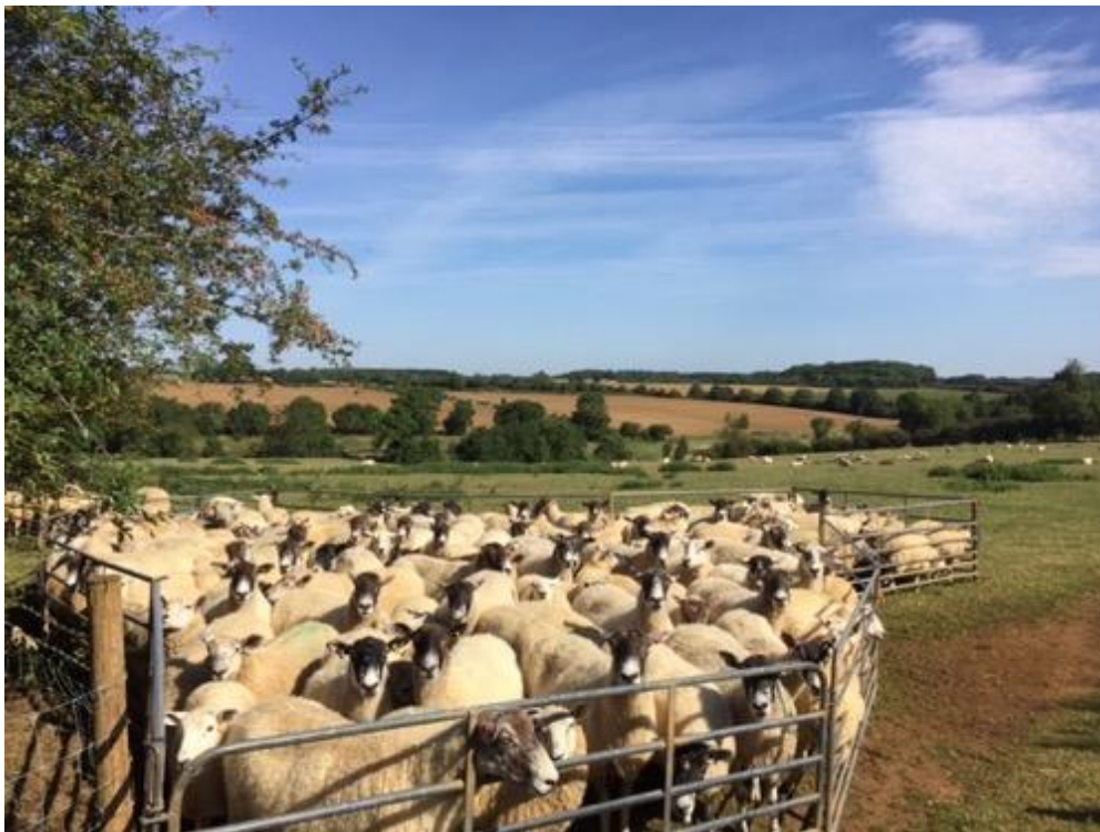
16. View from Colsterworth Rd looking north across fields from the edge of the Conservation Area.